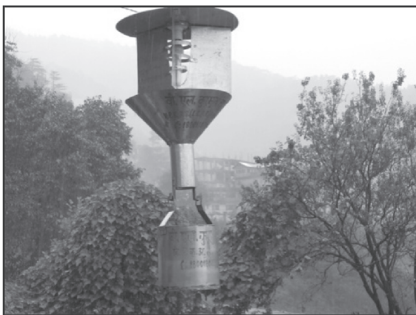
Figure 1. Light trap for mass trapping of beetles

Mass trapping: To collect adults (beetles) of white grubs, two light traps at each potato farm were installed at different positions during April to August, 2007–09. Light traps (Fig. 1) made of galvanized iron steel having a funnel